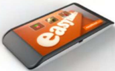
Smart Touch Central controller