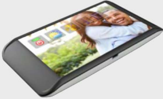
Pyrus wall controller

On top of all this we've even built in a scheduler. So in most cases there is no need for an expensive central controller anymore.