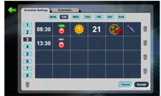
Pyrus II wall controller (includes 7 day Scheduler)

All this gives BMS companies and end users more flexibility to offer and gain the most simple and cost effective solution.